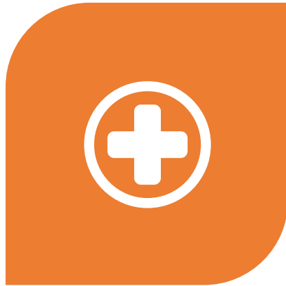
VETERANS HEALTH ADMINISTRATION