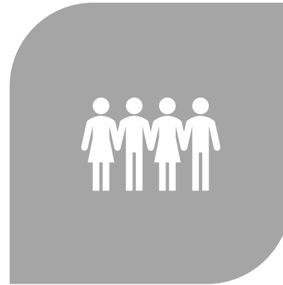
VETERANS BENEFIT ADMINISTRATION