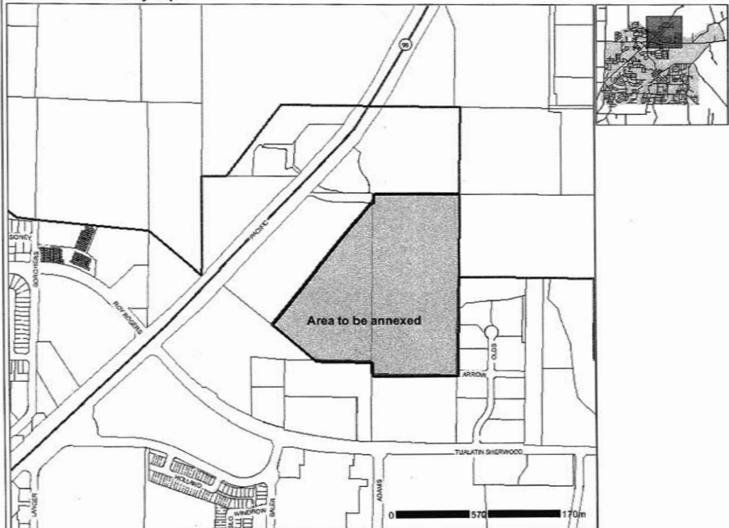
PGE Annexation Vicinity Map

No Arguments for or Against this measure were filed.