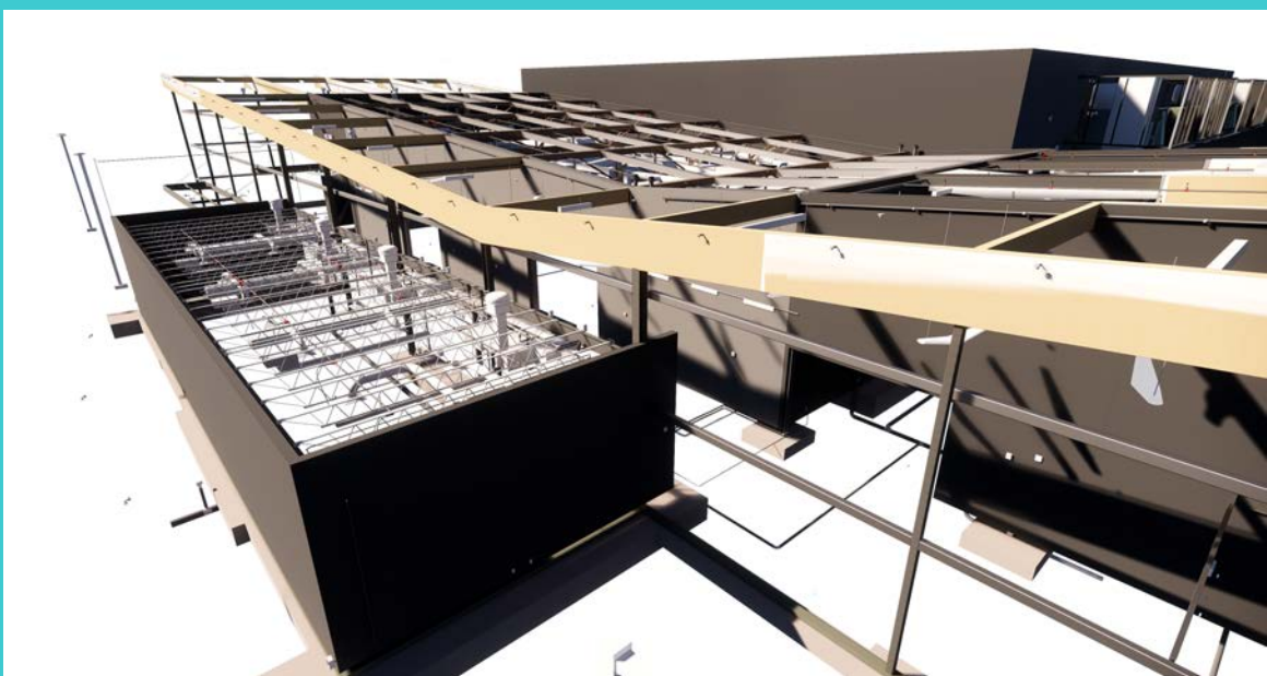
3D Modeling ensures "Fit and Finish"

Happy New Year from the Washington County Event Center project team!