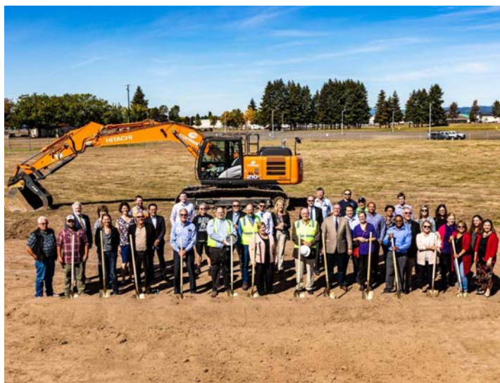
Groundbreaking September 2018