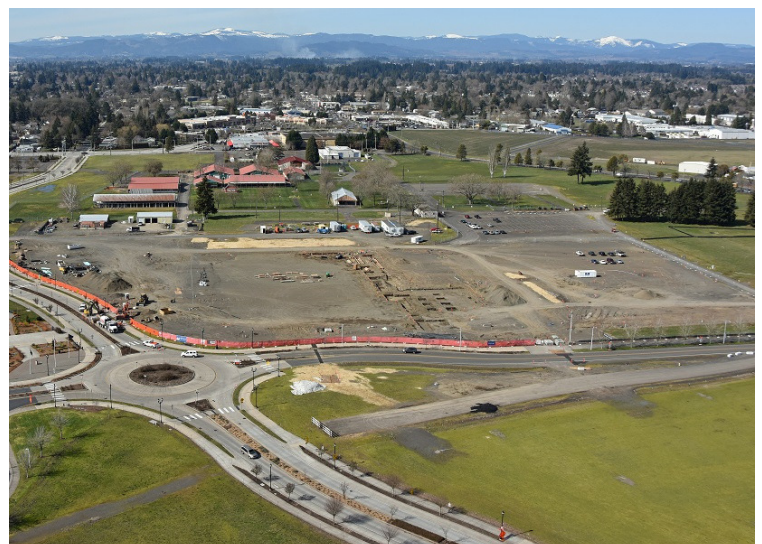
Site Work March 2019