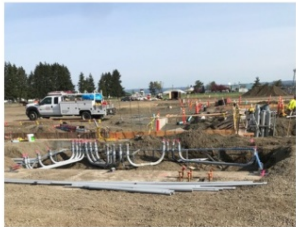
Plumbing, electrical, & gas underground installation at the kitchen