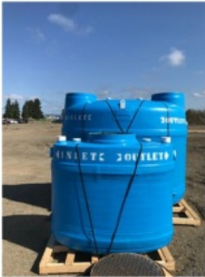
Pump station plumbing arriving on site