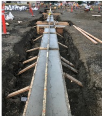
- Concrete foundation being poured and finished- Over 900 cubic yards total!