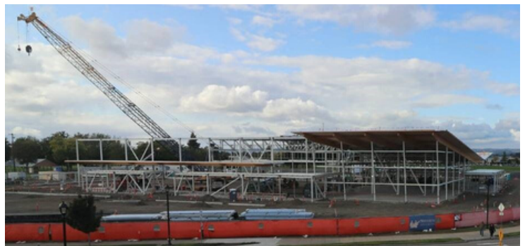
late Sept 2019