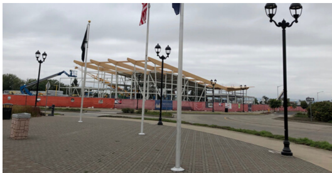
Early Sept, 2019