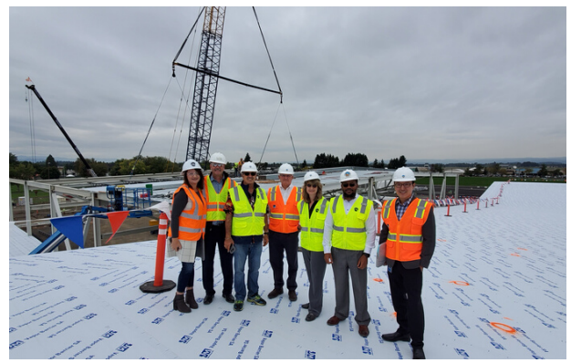
Above: Members of The Wingspan Event and Conference Center Leadership team tour the project site