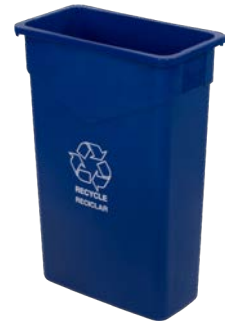
Slim Jim - 23 gallon (22"L x 11"W x 30"H)