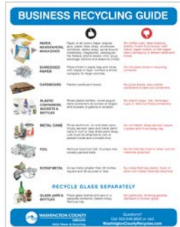
Business recycling guide (8.5 x 11 inches)