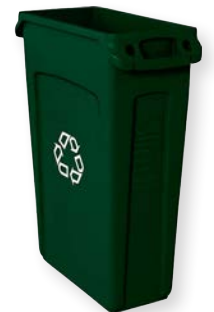
Slim Jim - 23 gallon (22"L x 11"W x 30"H)