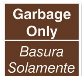
Garbage decal (10 x 10 inches)