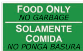
Food only decal - text only (6.5 x 11 inches)