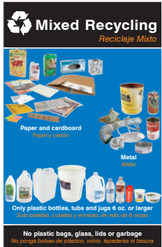
Mixed recycling poster (11 x 17 inches)

To request assistance or resources, email recycle@co.washington.or.us or call (503)846-3605.