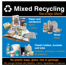
Mixed recycling decal (10 x 10 inches)