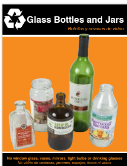
Glass recycling poster (8.5 x 11 inches)