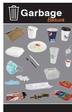
Garbage poster (11 x 17 inches)