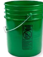
Bucket - 5 gallon (12.5"L x 12.5"W x 15"H)