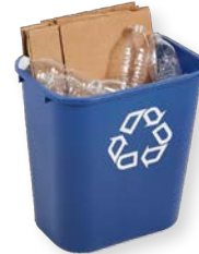
Desk side - 7 gallon (14"L x 10"W x 15"H)