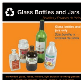
Glass recycling decal (10 x 10 inches)