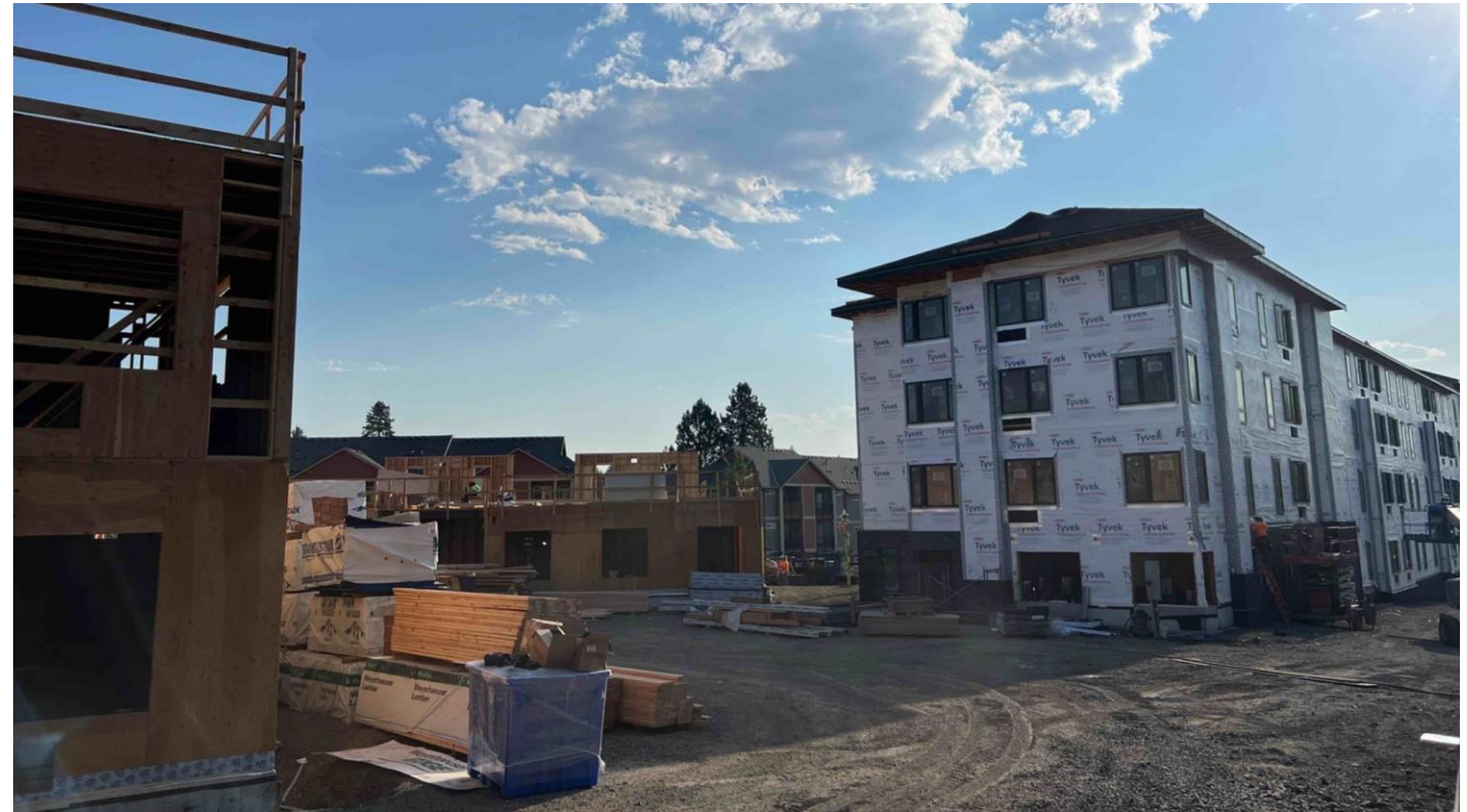
144 units in Tigard