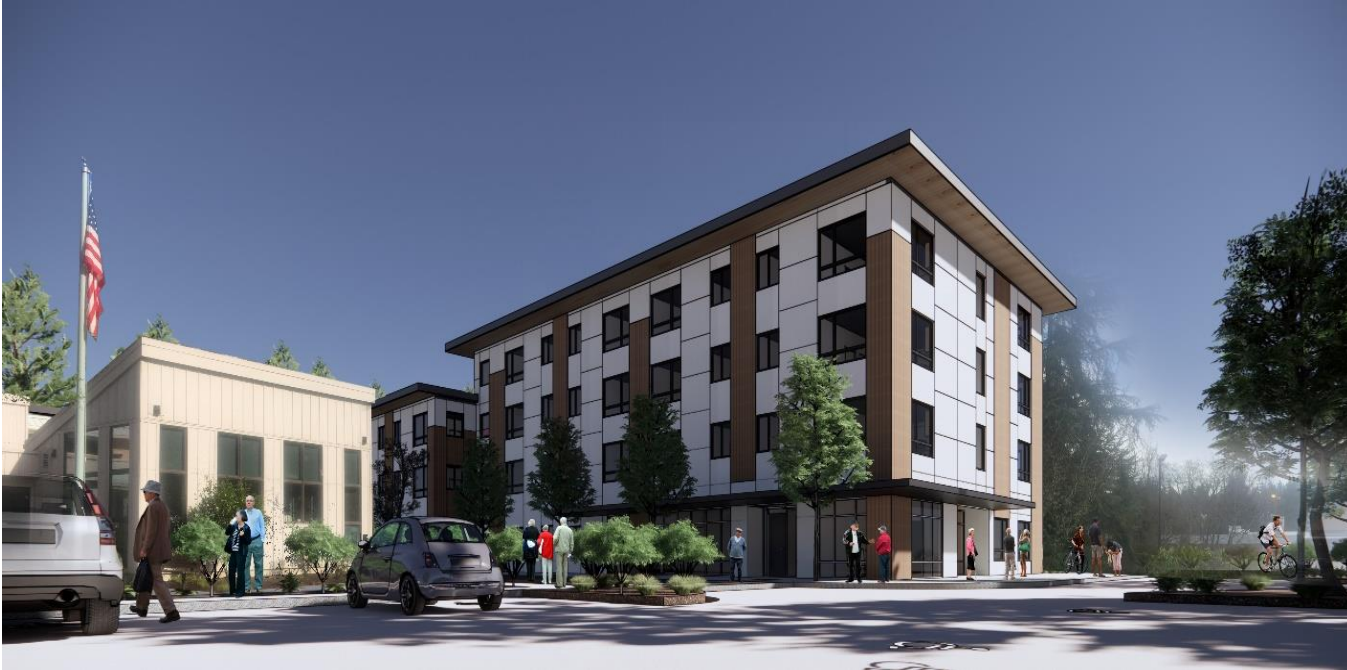
58 units in Tigard