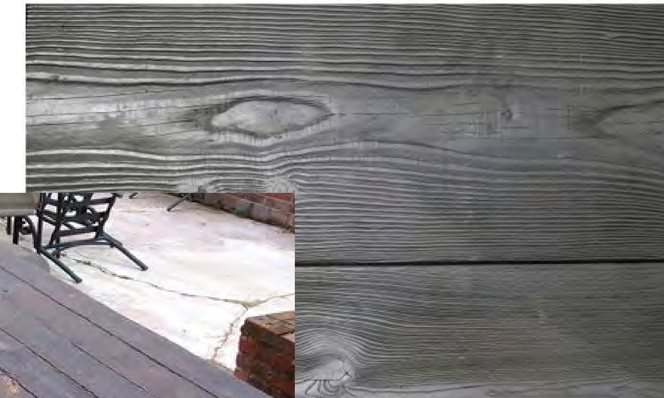
Wooden Plank Formliner Stained Brown