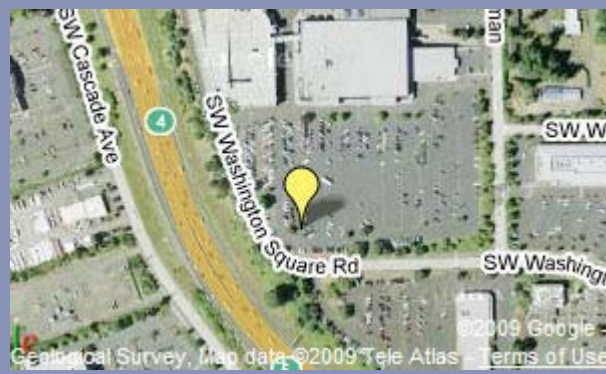
View larger map

Please, if you have any information that may help detectives with this case, call (503) 846-2594.