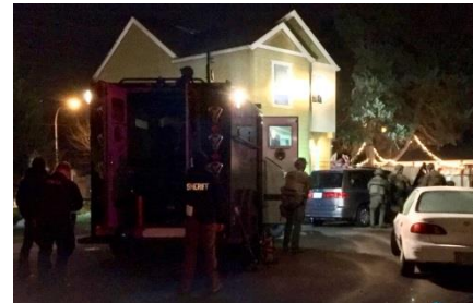
Photo from this morning's search warrant

The inter-agency Tactical Negotiations Team, Crisis Negotiation Unit, and Washington County Parole & Probation assisted during the search warrant.