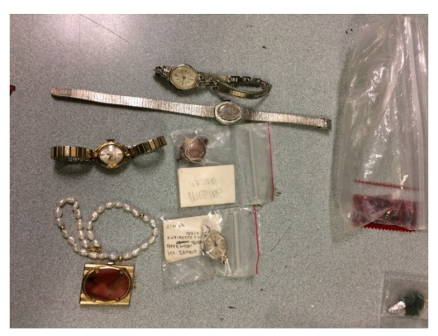
Jewelry 4 of 9