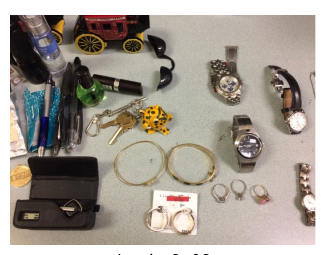
Jewelry 3 of 9