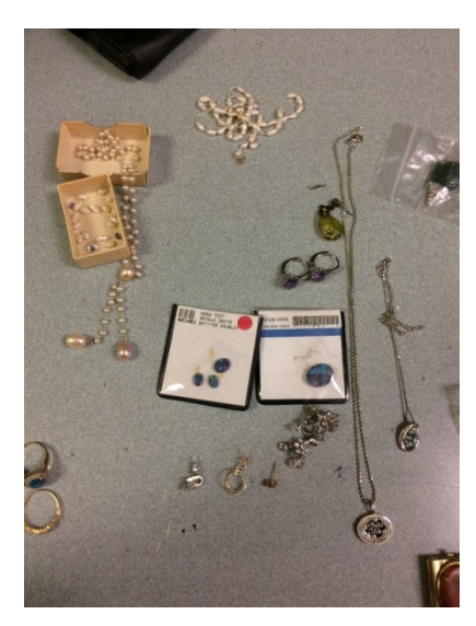
Jewelry 5 of 9