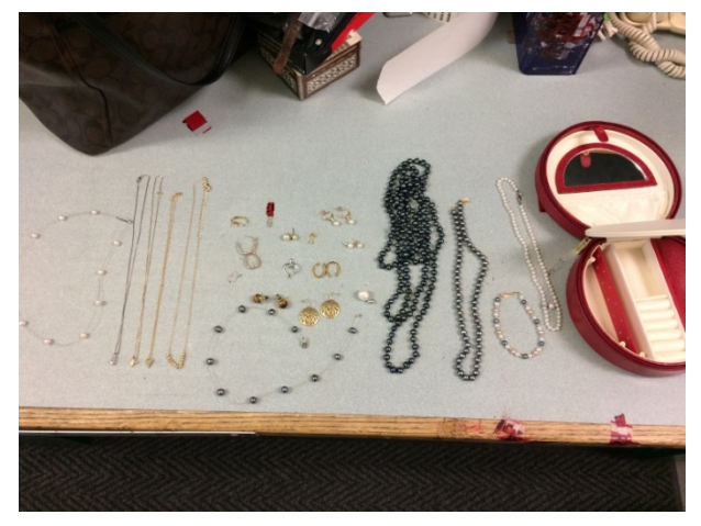
Jewelry 1 of 9