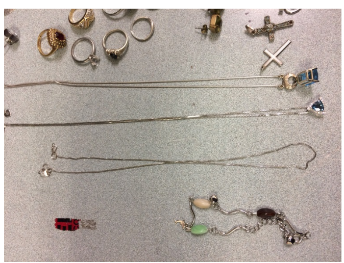
Jewelry 8 of 9