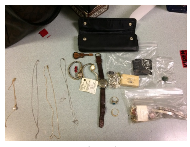
Jewelry 2 of 9