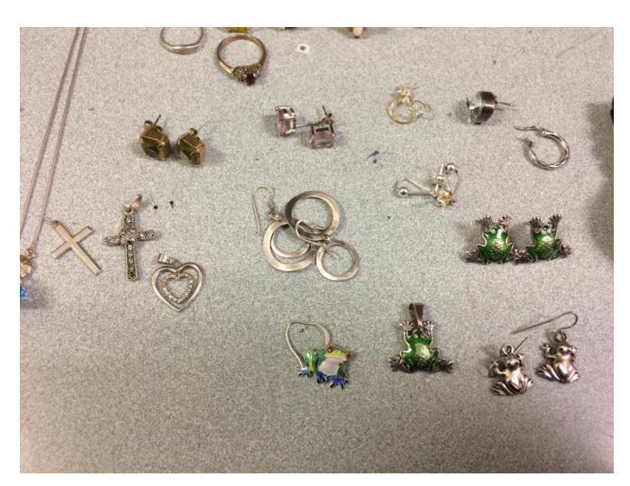
Jewelry 9 of 9