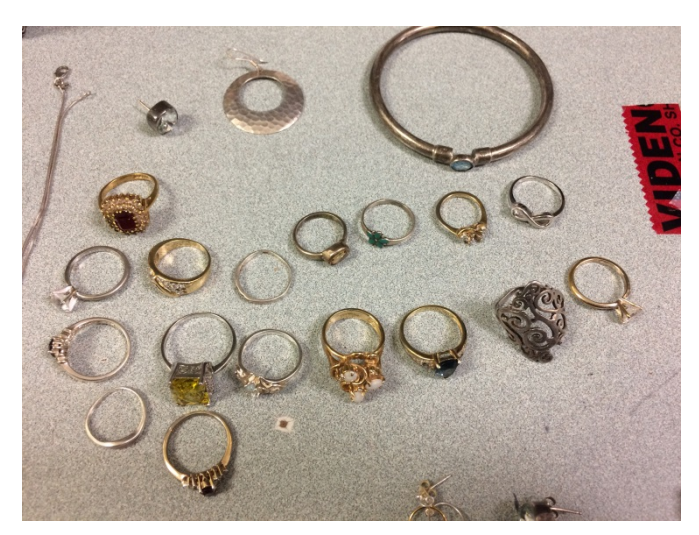
Jewelry 7 of 9