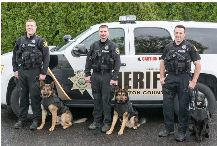
Three of Six WCSO K9 Handler Teams

Currently, the Sheriff's Canine Unit consists of three tracking teams, one narcotics team, and three canine teams dedicated to both tracking and narcotics detection (dual purpose canines).